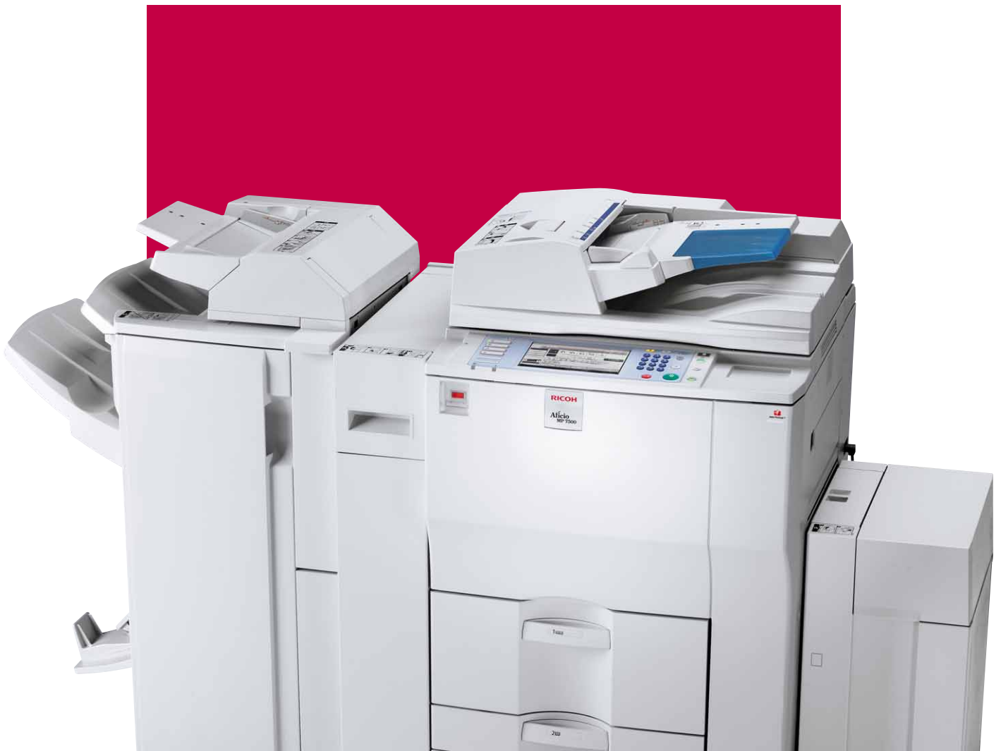
Aficio™ MP 7500